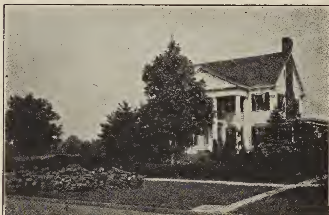
Amur River Privet Hedge

Winter Jasmine. Almost an evergreen. Offers a profusion of yellow blossoms during warm Winter days. 2 yr., 75c each, $7.50 per doz.